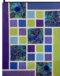
Sloth Quilt 40" x 50"