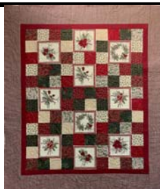
Winter Manor 45" X 56"